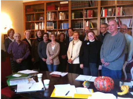
A cluster meeting at St. John's, Lattingtown

We thought if we got the four North Shore Episcopal Outreach directors and groups together, we could brainstorm, creating more ideas, find out what each other was doing, learn from one another, and perhaps work together to help one another in our efforts to have a greater impact. That is exactly what happened!