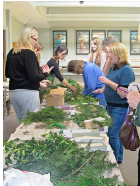
Parishioners making Advent wreaths on Advent 1